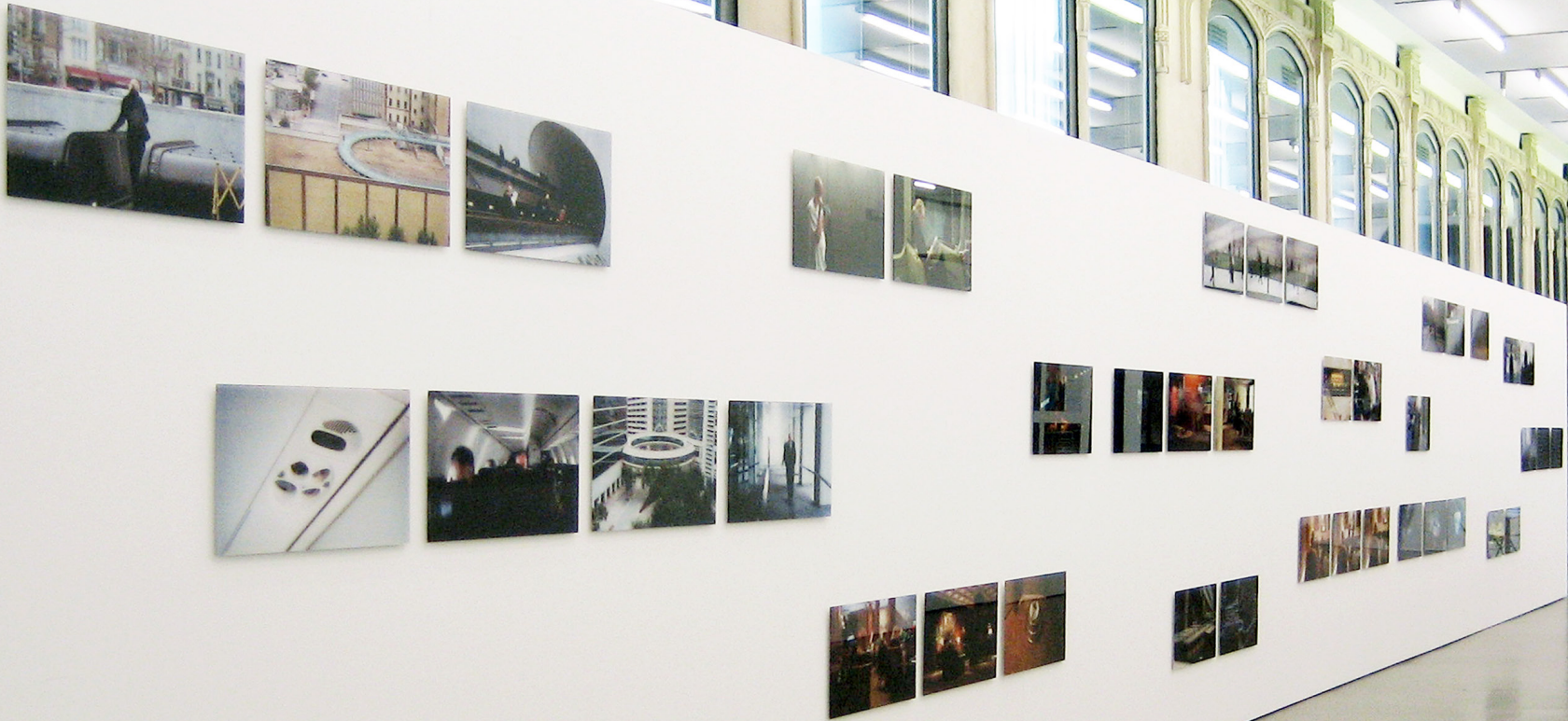
MARCO POLOMI Permult - Scenes from an Unmade Film 2005