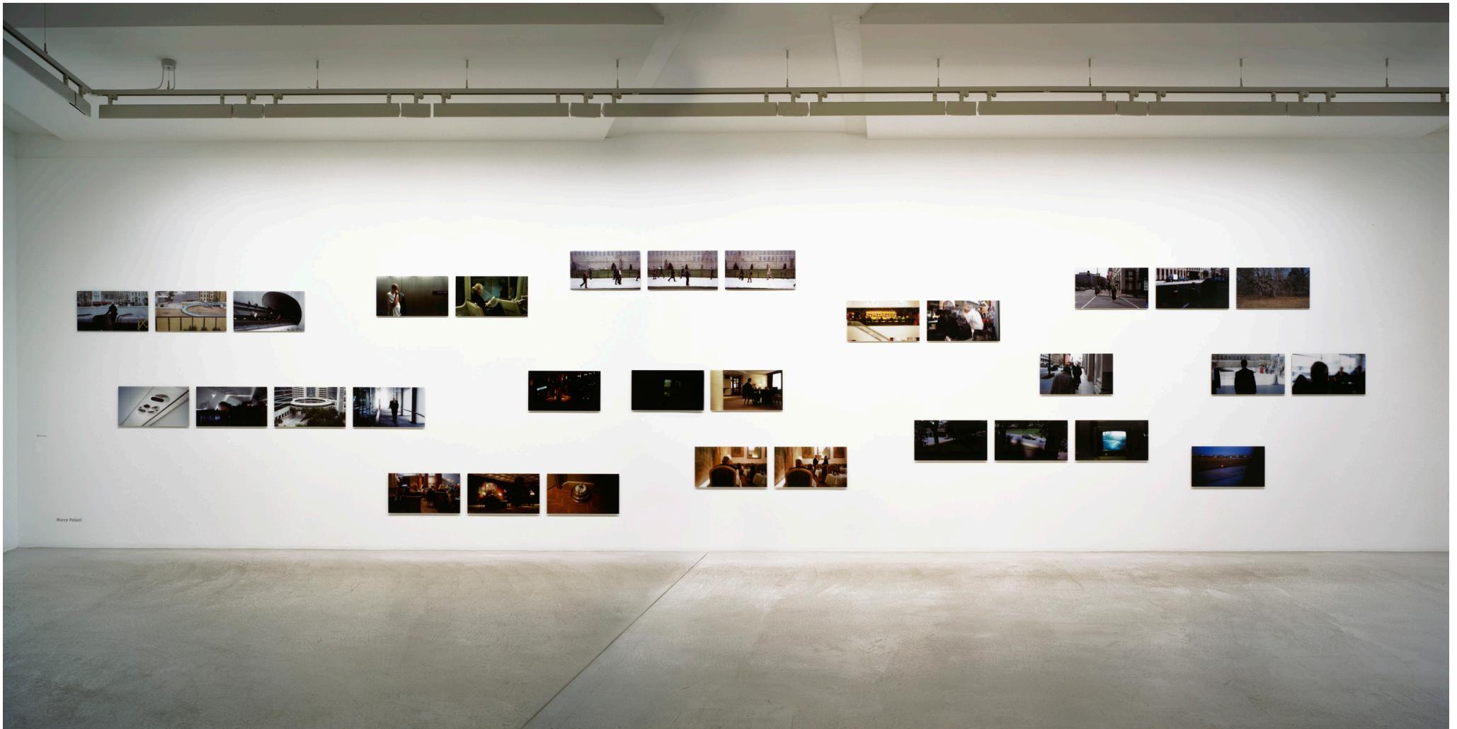
First page: installation view, Camera Austria. Graz, 2006, set of 40 photographs